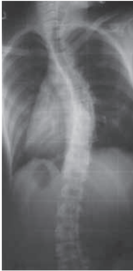
Scoliosis, and other major distortions in posture, benefited little from rehabilitation until just over a decade ago.

The efficacy of the brace in cases of AIS is best between Risser 0-2 – or roughly pre-menarche, or change in the voice, in the case of male patients – where most of the growth occurs in the trunk. In this age group, the DB has been proven not only to correct, or stabilize, the scoliotic curves